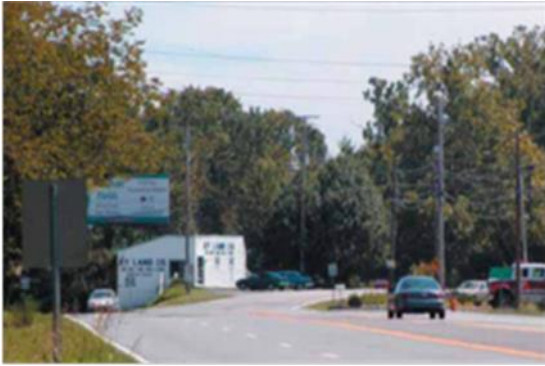
Western intersection of Shelbyville Rd. and Eastwood Cut Off Rd.